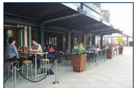
Al fresco at the Meat Market

AMIC wishes all of the State Sausage Kings our congratulations on your achievements at your Regional and State level and we look forward to your participation in what should be a robust and rewarding national competition in 2012.