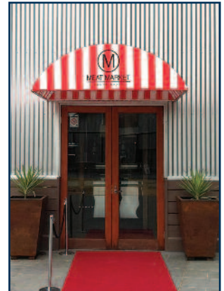
Venue for the Breakfast with the Butchers

There is plenty to see and do in the immediate area where the events will be held and interstate guests are encouraged to make the best of the opportunity to visit the variety of the tourist attractions that are in and around the city of Melbourne.