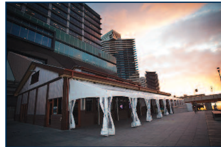
Showtime Events Function Centre

The program will commence on Friday 3rd February 2012 with the traditional Meet and Greet function in the evening, held at the Hilton. This will be followed by Breakfast with the Butchers, an apprentice competition, a trade show and of course the Sausage King Competition Judging all on Saturday. The presentation of the winning trophies will be held at a gala dinner on Saturday night.