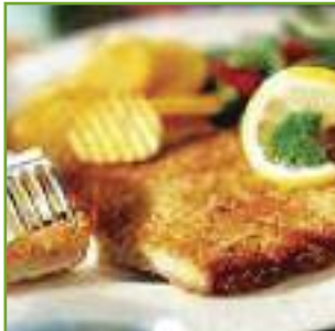
Crumbed Steak with gluten free crumbs of course!

Customers enjoy garlic butter chicken, beef stroganoff, lamb mini roasts, Italian meatballs, beef stir fry and Stockman's specialty chicken schnitzels with the knowledge that all products are gluten free. The latest addition to the range is gluten free hot BBQ chooks. Stockman's website even boasts a collection of recipes for customers to try themselves.