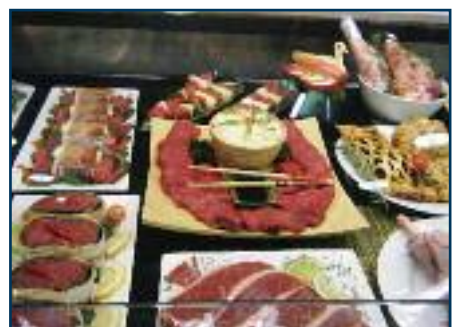
Artistic displays at the Meat Hall