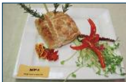
Mighty Nice Meats also came 3rd in the Meat Pie category with Beef Wellington