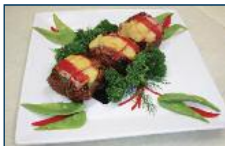
This beautifully presented Lamb Rump won first place for Bli Bli Butchery in the Wet Dish category