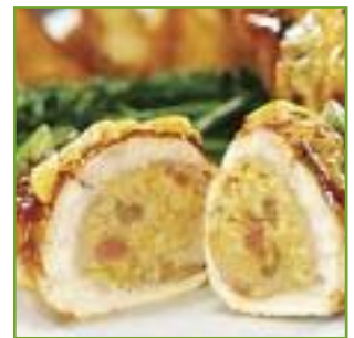
Chicken Mini Roasts

Stockman's has been able to tap into a niche market by offering an extensive gluten free range of products. Customers near and afar flock to the shop, often travelling from as far away as Toowoomba, the Gold Coast and Redcliffe. Their loyal customer base includes local customers, pubs and clubs that they wholesale to and online sales through their website to areas as far as Gladstone, Darwin and Victoria. Debbie even makes home deliveries to Toowoomba every three months.