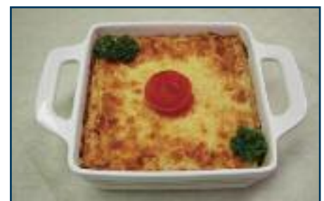
One of the Wet Dish entries – Beef Lasagne