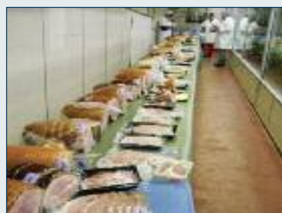
Hams on display at the RNA Ham, Bacon & Smallgoods Competition