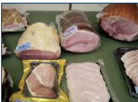
Hams on display