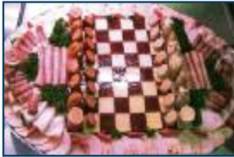
Gotzinger Smallgoods' Cold Meat Platter

The 2009 Ham, Bacon and Smallgoods Competition was held at the RNA Showgrounds in the AMIC Meat Hall Pavilion on the 5th of August. Entries in the competition increased this year by 30%! Thank you to all participants and congratulations to all winners, especially our new members who entered this year with no real expectations of winning. We were delighted to see them experience success.