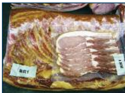
Bacon rashers up for judging