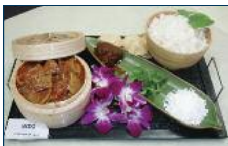
Mighty Nice Meats came 3rd in the Wet Dish category with Beef Rogan Josh