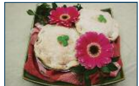
Nambour Plaza Meats came 2nd with this Beef, Bacon and Guinness Pie