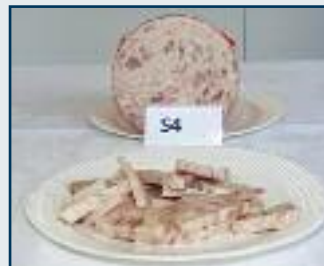
A Strasbourg entry in the Smallgoods Competition