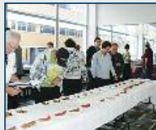
A class of future butchers taking a look at the entries