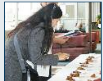
A teacher visiting from China in total awe of the competition