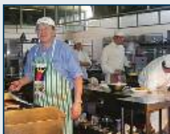
One of these people is NOT a TAFE chef