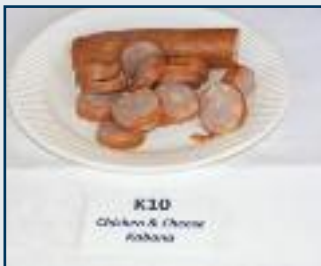
1st in the 'Melbourne A' Kabana category