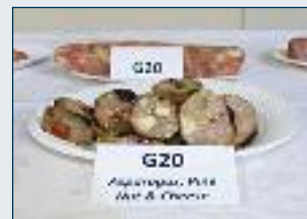
Award winning gourmet sausage