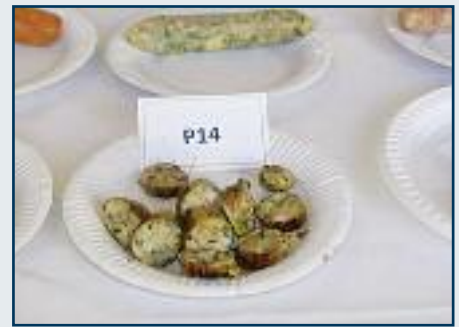
That looks good!