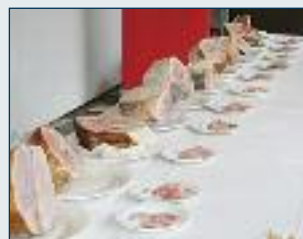
Delicious hams ready for tasting at the William Angliss Institute of TAFE